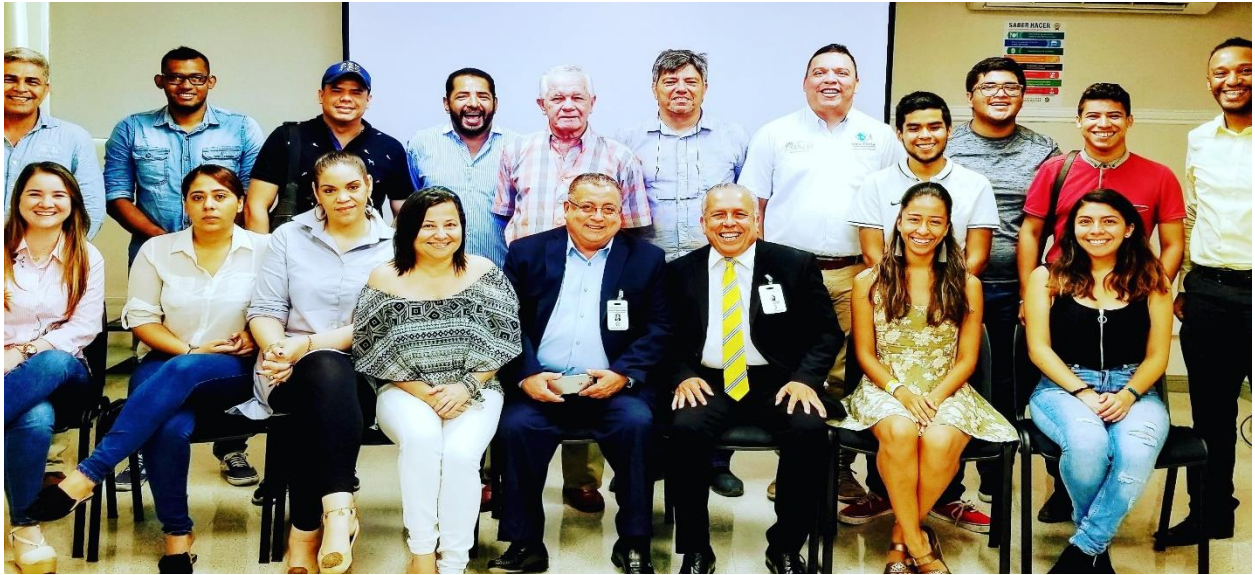
THE FIRST CONFERENCES IN MEDELLIN /MARCH 2021