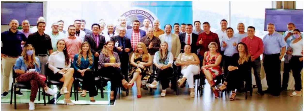
The Second conference in Bogota-CEO Summit /June 2021