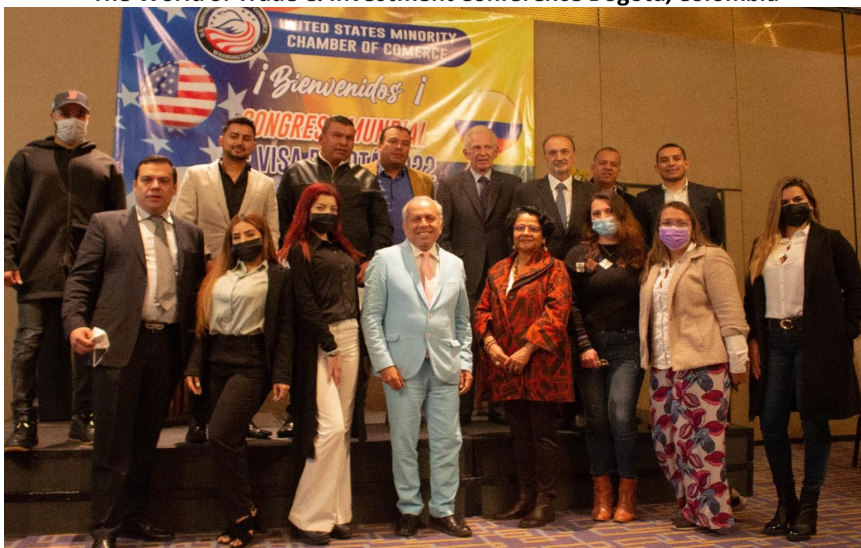
THE WORLD VISAS CONFERENCES FOR INVESTORS