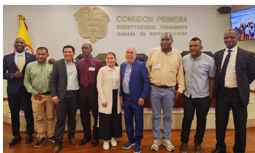
Alliance with Pyme Organization-Cartagena Congress of Colombia