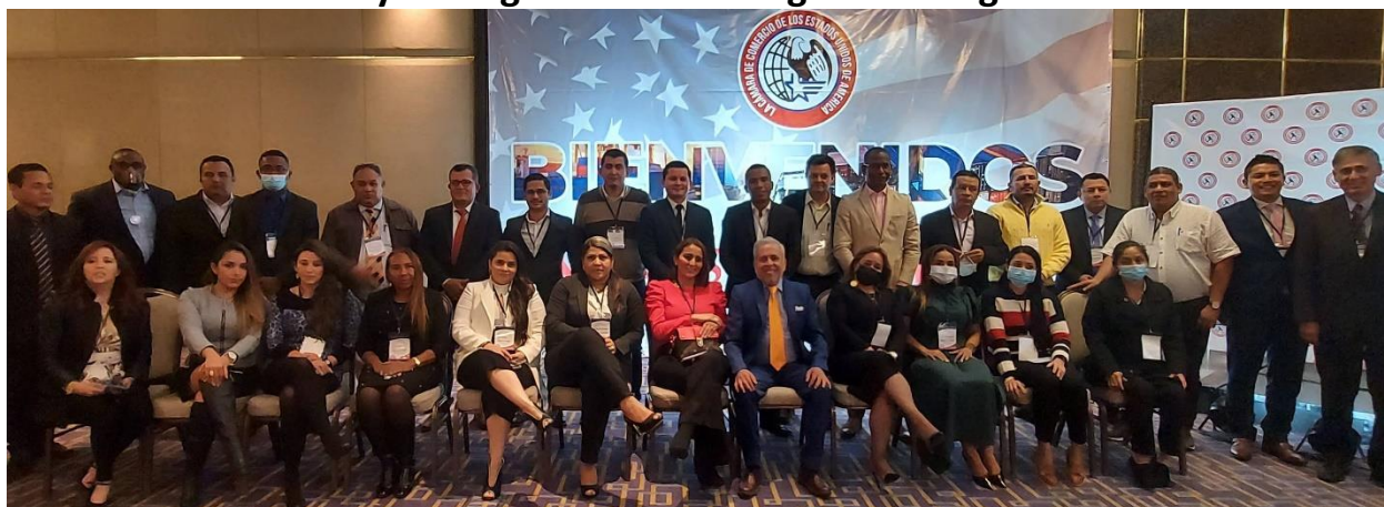
The World of Trade & Investment Conference Bogota, Colombia